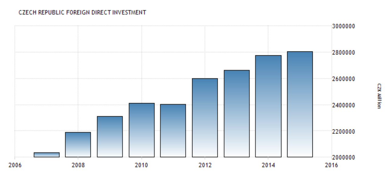
TABLE 3 Foreign direct investment